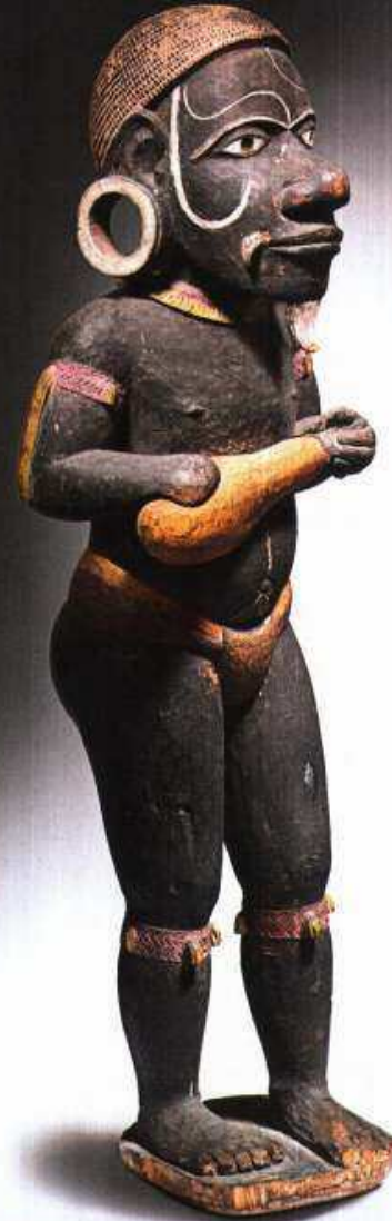
Effigy of Paruvo from Marovo Lagoon, Solomon Islands, c1910-1930

❖ In The Next Room Or The Vibrator Play , MTC Theatre Sumner, Melbourne. A 19th-century doctor, whose method for treating female hysteria really hits the switch, finds his wife wants the same medicine in a play that set Broadway abuzz. mtc.com.au