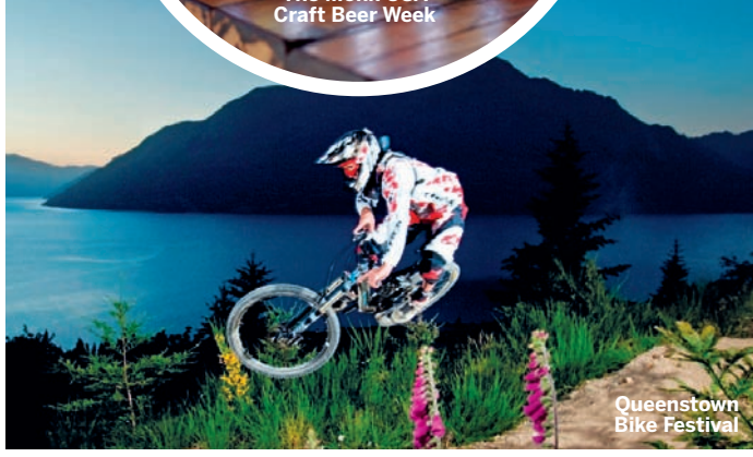
Queenstown Bike Festival