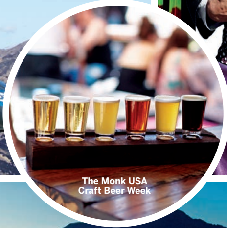
The Monk USA Craft Beer Week