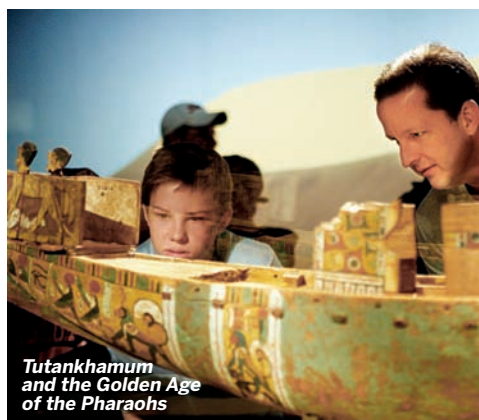
Tutankhamun and the Golden Age of the Pharaohs