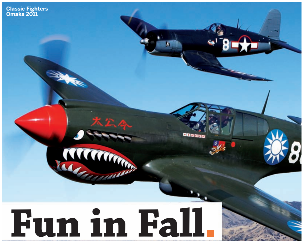
Classic Fighters Omaka 2011

Saltimbanco is on 21 April–21 August in Perth, Melbourne, Sydney, Brisbane, Adelaide, Hobart, Newcastle and Wollongong. Tickets from Ticketek 132 849.